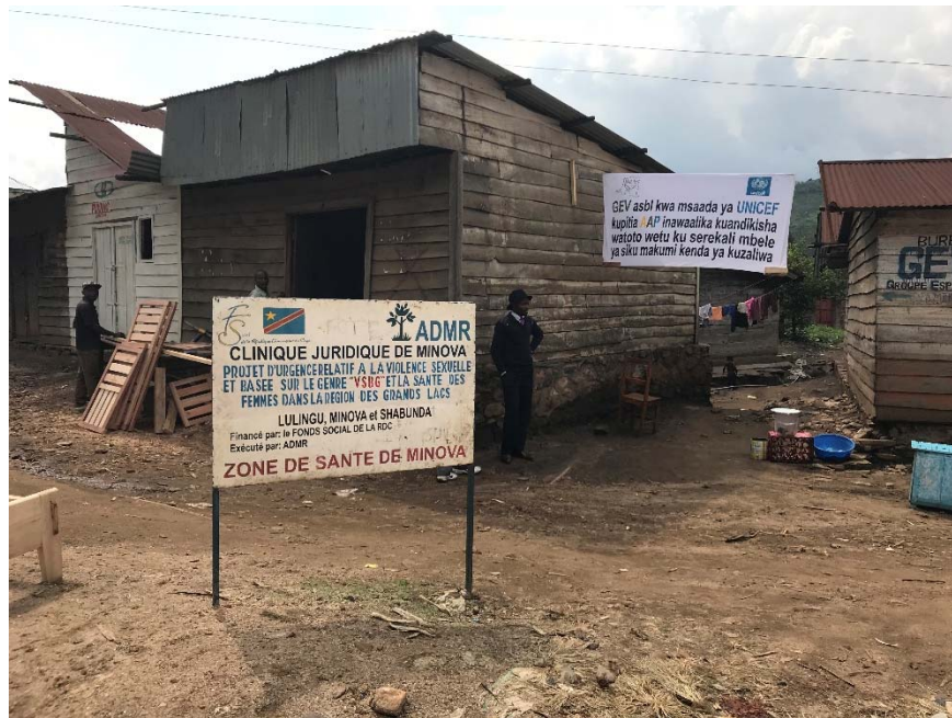
Picture 10: Legal clinic of ADMR, one of the NGOs providing services under the Project

360. CI also hired Heal Africa to conduct a FGD with the Contractor’s female workers to identify GBV risks, assess their specific needs, and provide psychosocial support to survivors identified. This activity was conducted in December 2017 and its results were discussed above. In addition, Management is conducting a review of GBV risks and to date has identified a total of 32 GBV allegations in all roads financed under Pro-Routes. 466