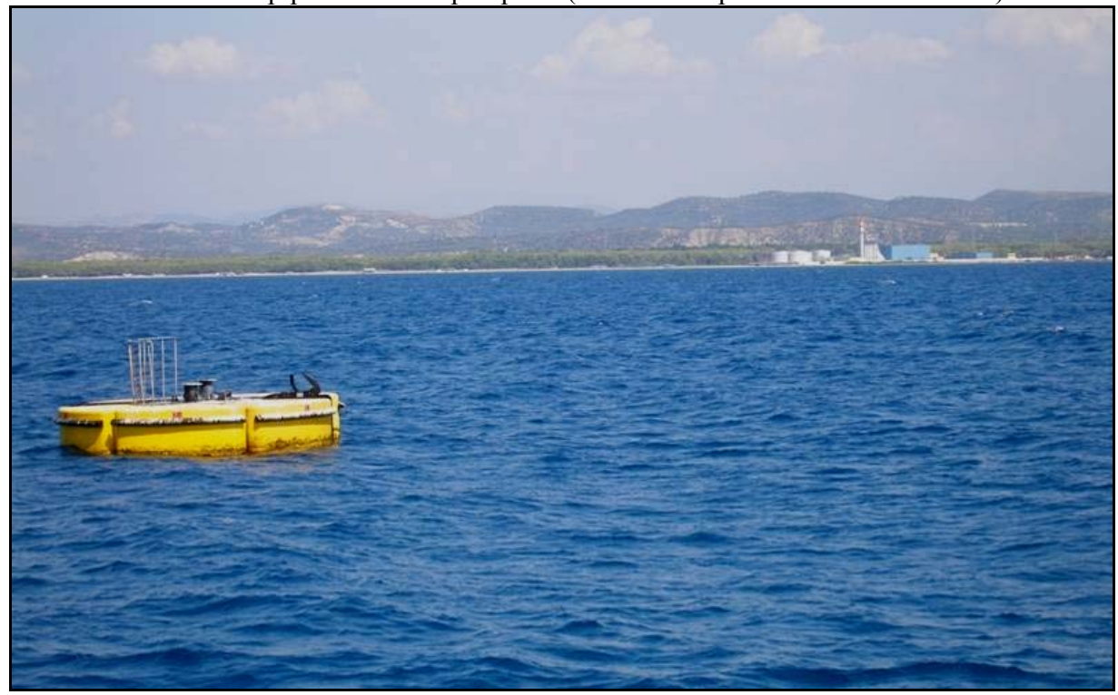
Photo 9. New buoy for securing tanker to off-load fuel; plant in distance

Photo 8. Oil pipeline hook-up at plant (valves and spill containment at base)