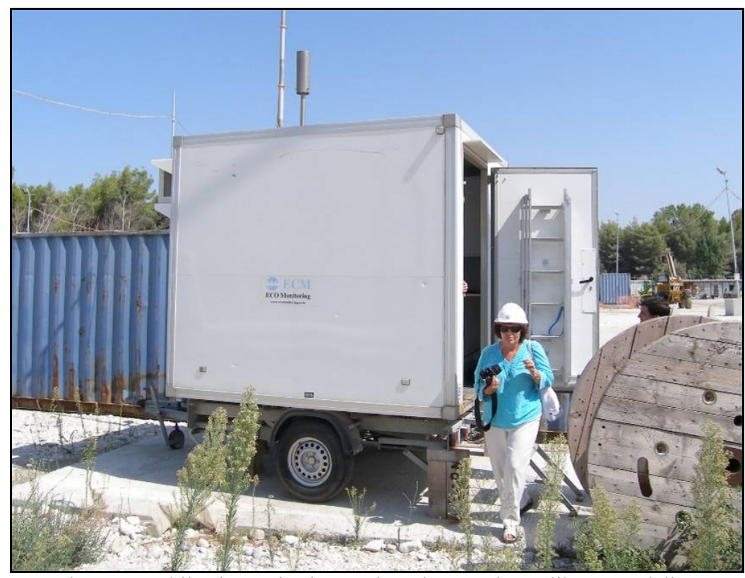
Photo 6. Mobile air monitoring station; data used to calibrate modeling