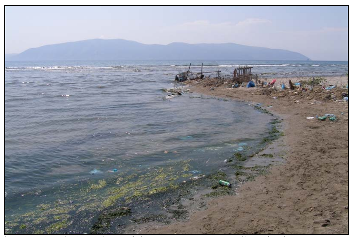
Photo 12. Vlora city beach (north of city center); some water quality and maintenance concerns