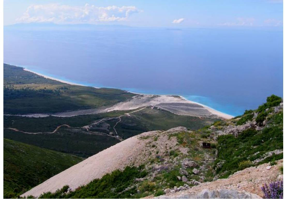
Photo 17. Coastal area further south of Vlora on the other side of the Karaburun Peninsula

Photo 16. Beach south of Vlora city center