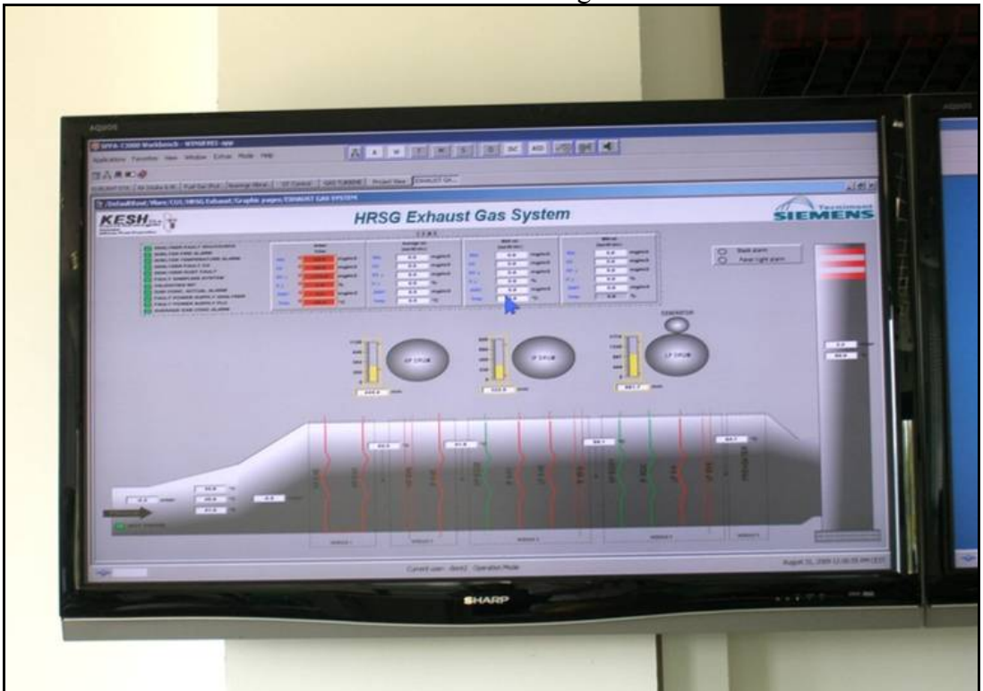
Photo 5. Readout of air monitoring station in operator room (indicative since plant not yet operational)

Photo 4. Continuous air monitoring station near stack