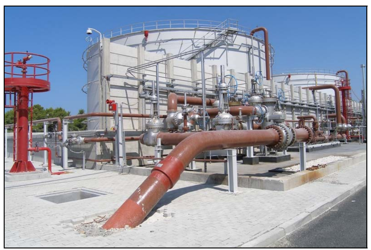
Photo 8. Oil pipeline hook-up at plant (valves and spill containment at base)