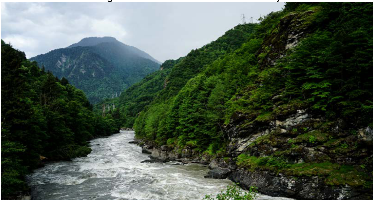
Figure 2: Portion of the Nenskra River Valley