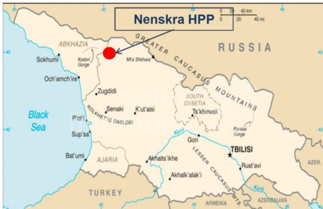
Figure 1: Map of Georgia Showing the Proposed Nenskra Hydropower Project