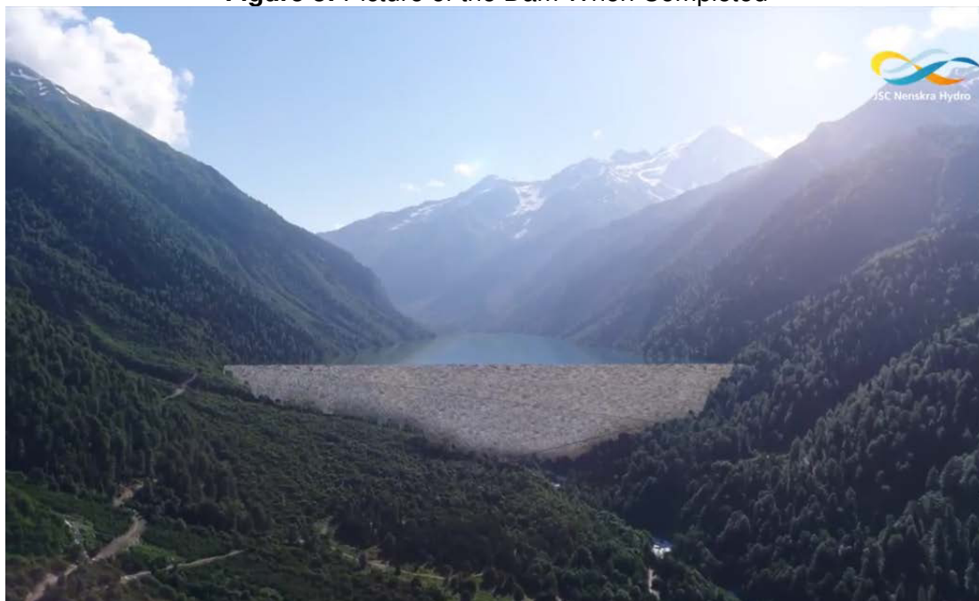
Figure 3: Picture of the Dam When Completed