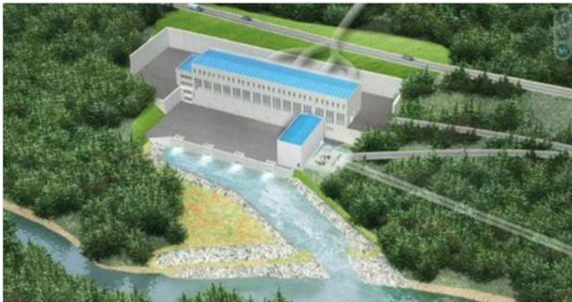
Figure 4: Picture of the Power House When Completed