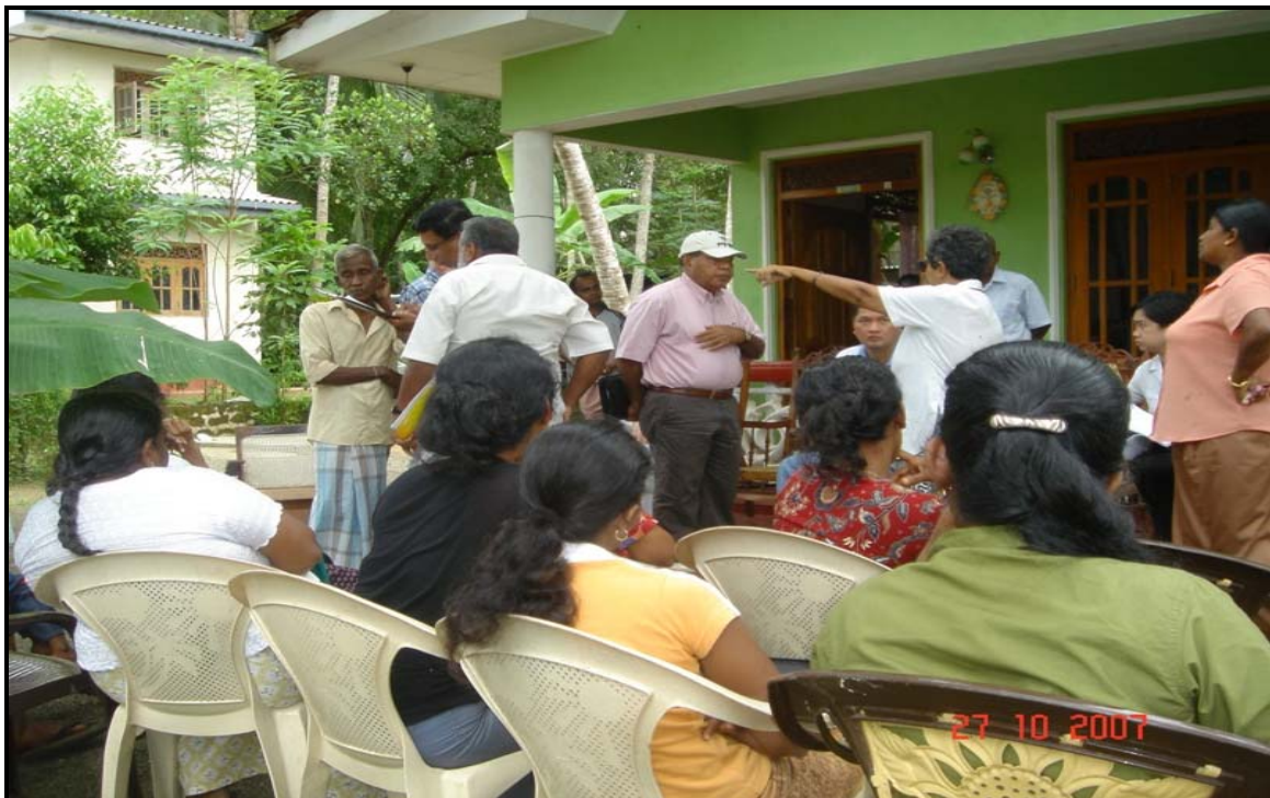
Photo 4: Discussion with project-affected people in the JBIC section of the highway