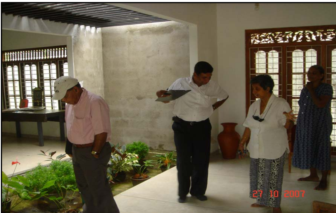
Panel meeting with a self-relocated project affectee (extreme right) in her house in JBIC section of the highway