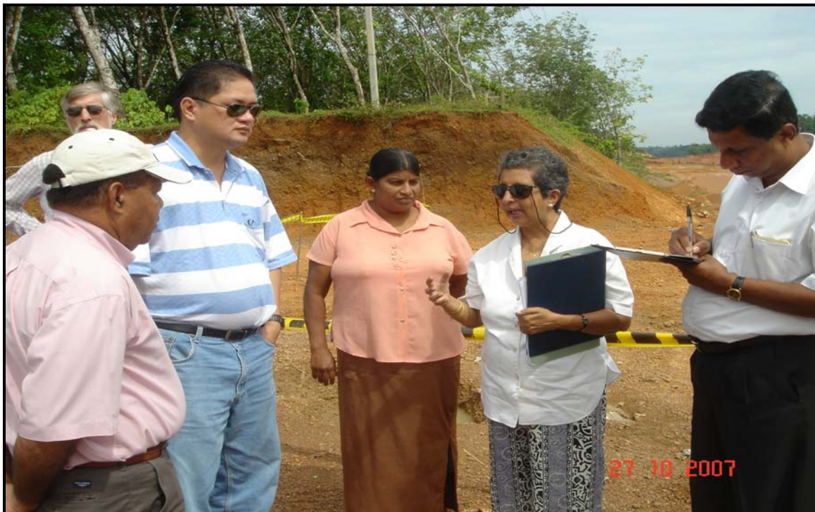
Photo 2: Panel members discussing with project affectees in JBIC section of the highway