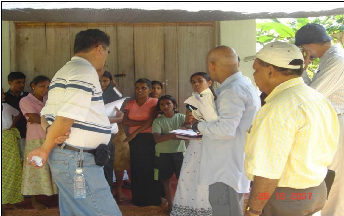
Photo 5: Discussion with project affectees in Annasigalahena, an STDP resettlement site