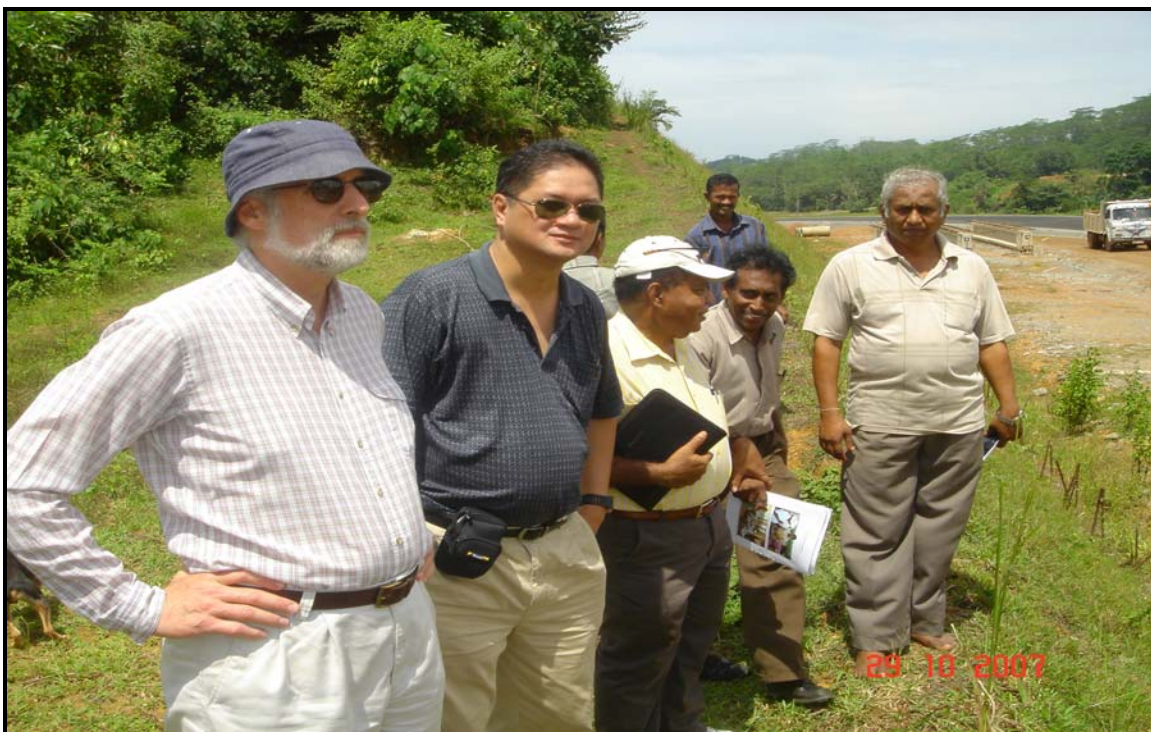
Panel discussing with project affectees in ADB section of the highway