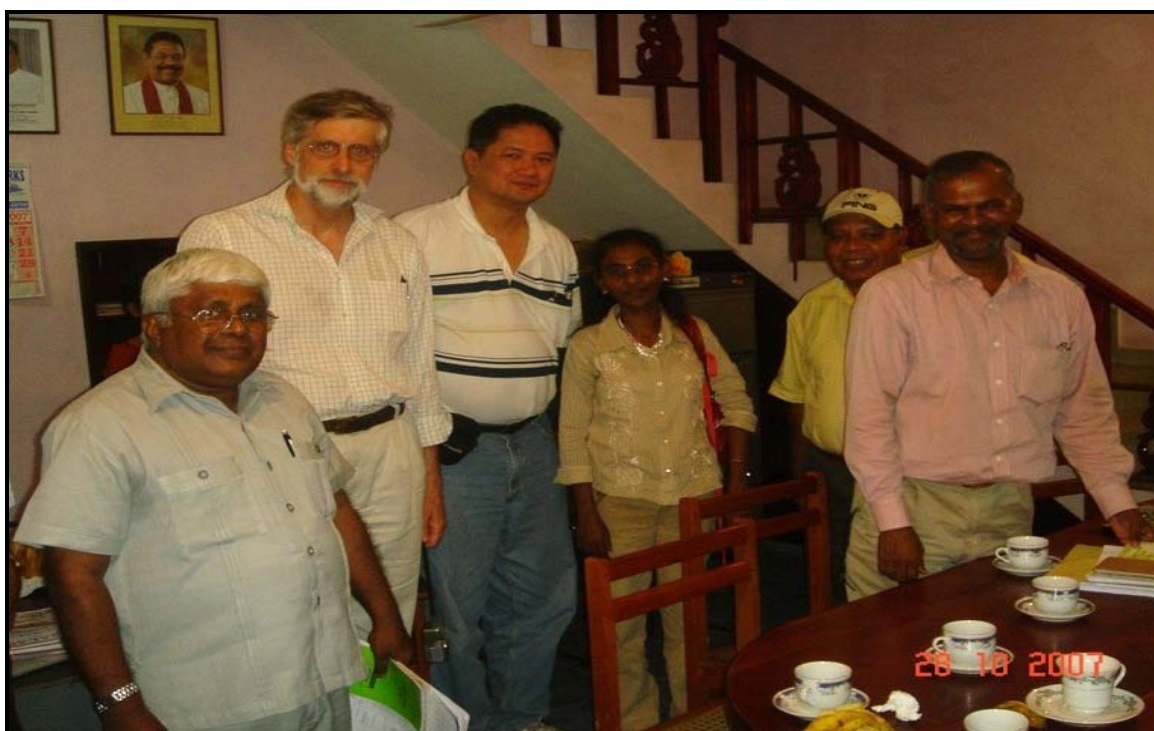
Panel meeting with STDP project staff in ADB section of the highway

18. The CRP discussed with or obtained information from ADB staff in its Headquarters and in SLRM; GOSL officials including those from the Ministry of Finance and Planning, the Ministry of Highways (MOH), RDA, and the Central Environmental Authority (CEA); STDP consultants; STDP affectees; and civil society through in-person interviews, email, telephone, and/or teleconference. The CRP discussed with SLRM updates on the implementation of the CA. The latest CA update provided by SLRM to the Panel as of 1 November 2007 is in Appendix 2 (with the last column on "Compliance Status" filled in by the Panel based on its determination of the progress made on each recommendation).