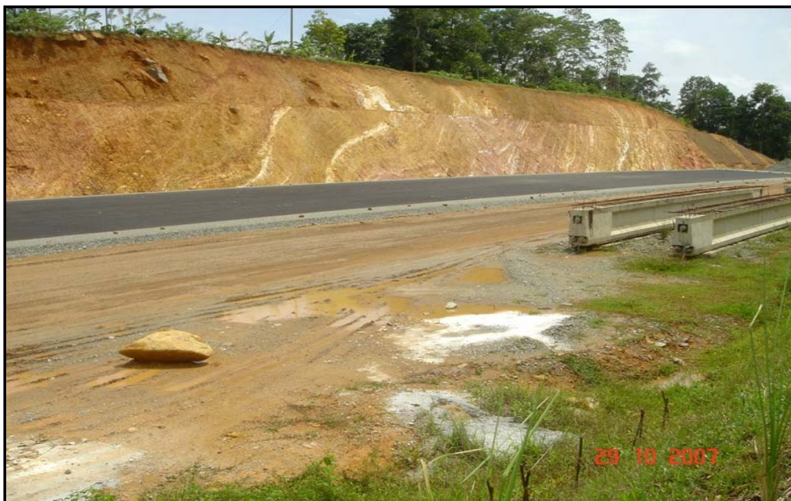
ADB section of the highway under construction

review for the Project in August 2006 stated that the contract completion date scheduled for February 2008 is likely to be extended by a further period. The Panel understands from SLRM that a restructuring of this contract into two packages is underway: package one with funding from ADB will include completion of civil works for two lanes and expansion to a 4-lane highway together with the Galle Access Road, and package two with funding from a new cofinancier or GOSL will include completion of civil works for two lanes and expansion to a 4-lane expressway for the southern 30 km of the highway. The JBIC section has two contract packages: package one for a 4-lane highway, closest to Colombo, was awarded in August 2005, and package two for a 2-lane highway was awarded in March 2006 with scheduled completion by September 2009 and March 2010, respectively. These two contracts are now scheduled to be completed by February 2010 and August 2010. The Panel understands from SLRM that the JBIC package two is also being restructured to a 4-lane highway. The civil works have been delayed due to various issues including those related to resettlement, delay in handing over of sites to the contractors, soil conditions which were not determined at the time of bidding, and slow progress of works by the contractors. 9