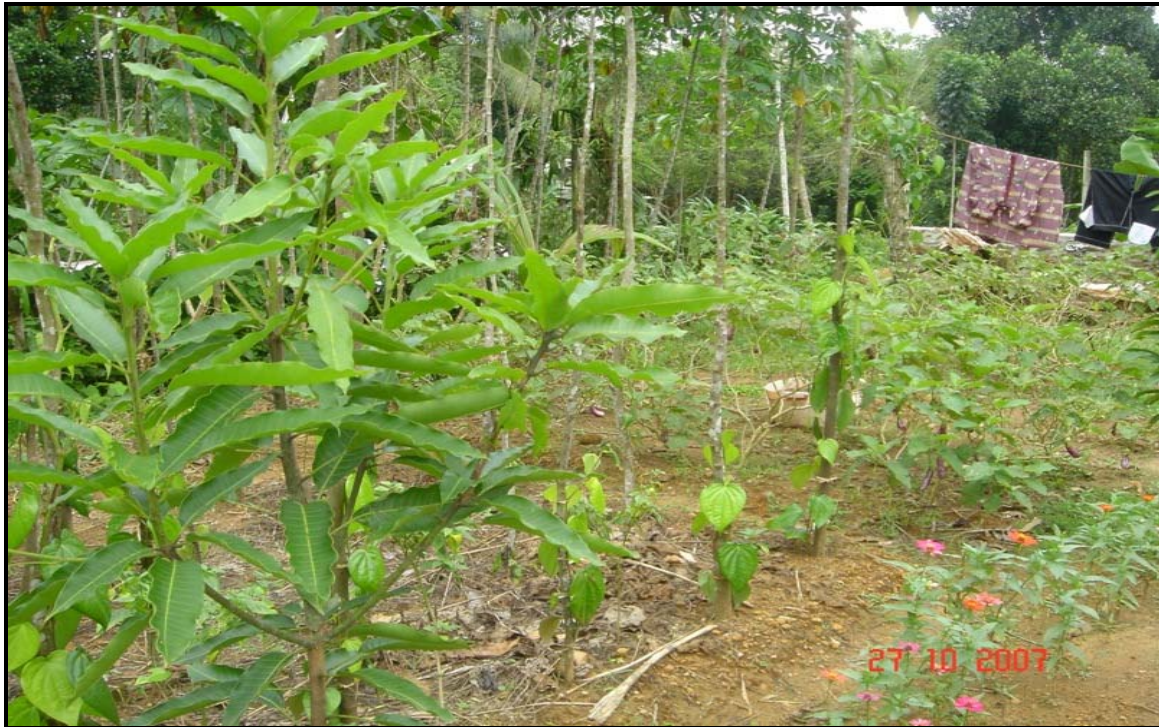
Photo 3: A self-relocated project affectee's home garden in the JBIC section of the highway